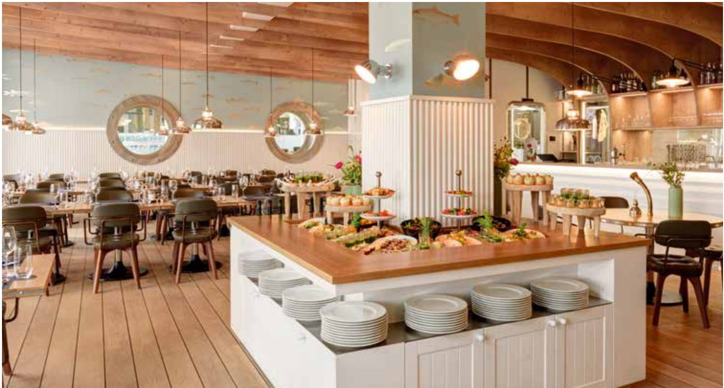
Top left Waiting on info Top right Original BTC's Pillar Light Narrow Polished Brass wall fixtures shimmer on the sea-tiled walls in Hafen restaurant's bathrooms. Above indoor dining area with Original BTC's Ginger Bracket Wall Lights on fish-printed central column featured along with Davey Lighting's Aluminium Pendants above the tables.

Handlova's Shibari pendants are suspended with rope tied around the glass. This lighting is based on the Japanese bondage technique called Shibari, wherein each part has its own binding that creates a kind of ornament.